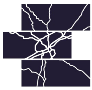
Figure 1: TIP Programming Summary